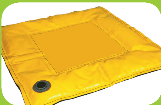
EPL 085 Weighted Drain Cover

Also available in 3000 and 4000mm length