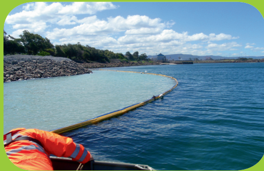
Aquatic Silt Curtain

EPL 070 100mm float, 6mm gal chain ballast, 1000mm geotextile skirt