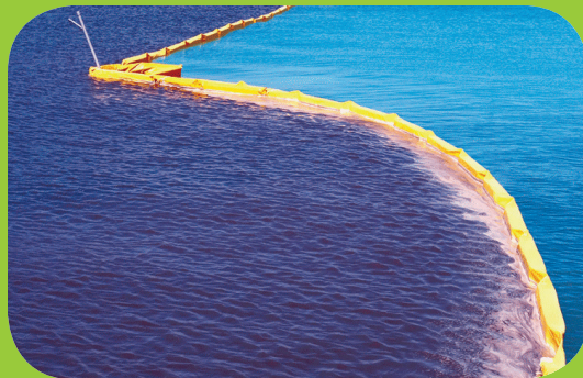
EPL 072 Marine Containment Boom