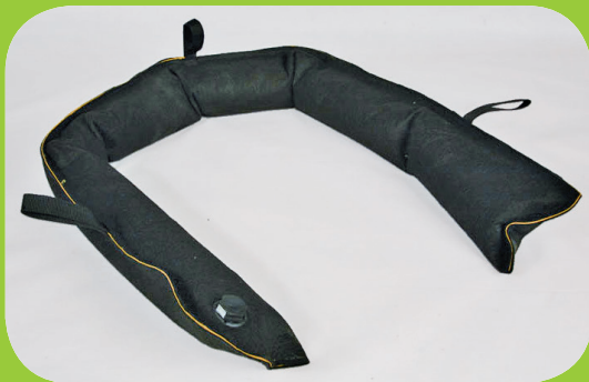
EPL 084 Weighted Containment Boom