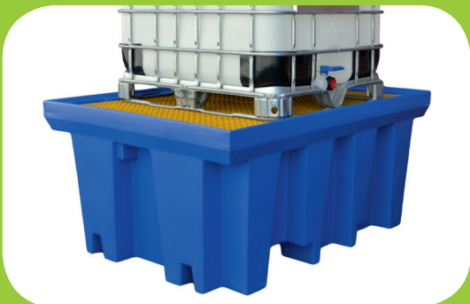
EPL 087 1 x 1000L IBC Bundled Pallet

Dimensions 1290 x 1290 x 250mm, Capacity 230L, SWL 1,000kg, Weight 33kg