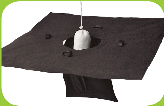
EPL 083 Drain Warden