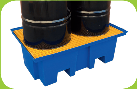
EPL 086 2 x 200L Drum Bundled Pallet

Dimensions 1290 x 860 x 440mm, Capacity 230L, SWL 600kg, Weight 28kg