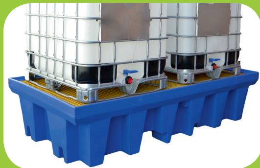
EPL 088 Double IBC Bundled Pallet (2 x 1000L)

Dimensions 1760 x 1350 x 780mm, Capacity 1150L, SWL 1850kg, Weight 107kg