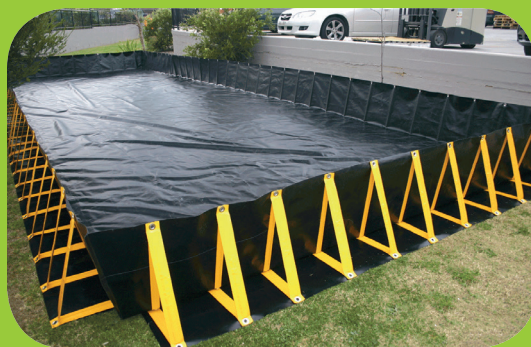
Heavy Duty PVC Portable Containment Bund